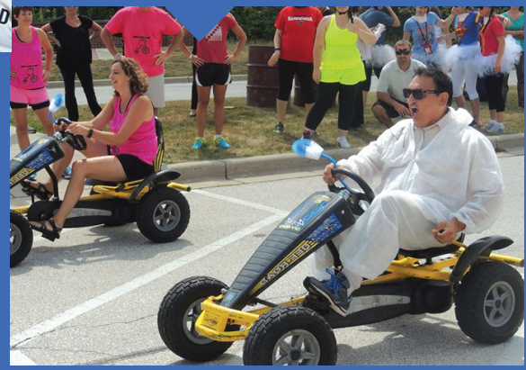
Moen "Hoops for the Heart"

https://unitedwaycoastalnc.org/campaign-toolkit